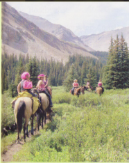
Wild Deuce Retreats and Outfitting offers specialized retreat rides just for women.

The women's retreat ride is the only trip offered by Wild Deuce that does not allow the vacationer to lift a finger. Everything is done for you. You wake to the smell of breakfast cooking and make the decision to roll over and catch some more sleep or get up for a cup of fresh coffee. Your choice. You don't have to pack your own gear, you don't have to cook, clean, plan, or schedule anything. There will not be any cell phones ringing or any computers begging for your business input. You'll hear sounds of the